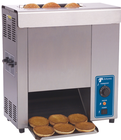
VCT-25 Vertical Contact Toaster

The Vertical Contact Toaster gives buns a consistent, golden brown finish which helps the sandwich stay firm and delicious. The VCT-25 has a preset toast time of 25 seconds.