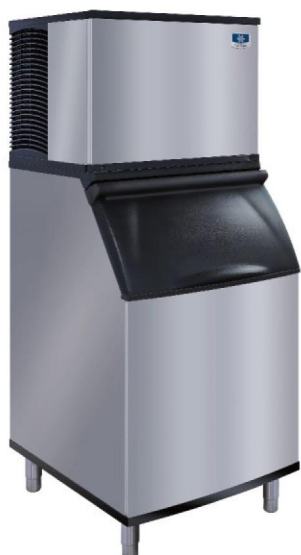
M700 Ice Machine on A570V Bin

Model: MD0700A-251B MY0700A-251B MD0700W-251B